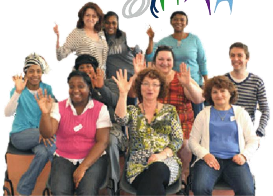
Its been really exciting year so far for the Lewisham Parent & Carer's Forum (some members of the Steering Committee pictured above) to find out more, turn to page 3