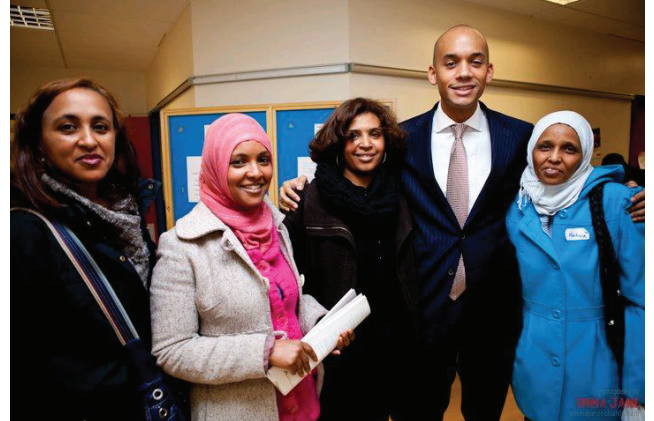
Chuka Umunna MP, with parents