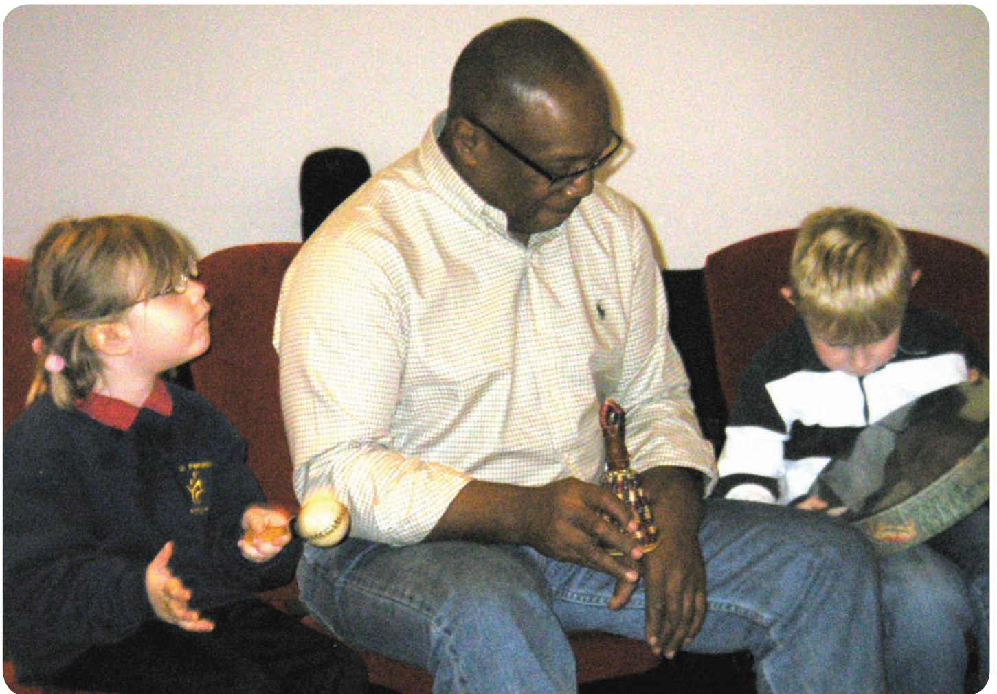
Drummer, Billy Cobham enjoying making music with children at our Autumn drumming workshop

The views and suggestions in this newsletter are those of individual contributors and are not necessarily supported by Contact a Family. Contact a Family cannot accept responsibility for any goods or services mentioned in or enclosed with this newsletter